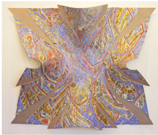
Long Distance Runner , 2010; acrylic, saffron, colored pencil, and staples on linen, paper, and canvas; 58 x 69 in. Courtesy of the Artist and Anthony Meier Fine Arts, San Francisco.

The flower-like formations of White Chrysanthemum I and White Chrysanthemum II (2010) that faintly emerge from almost within the canvas are driven by the