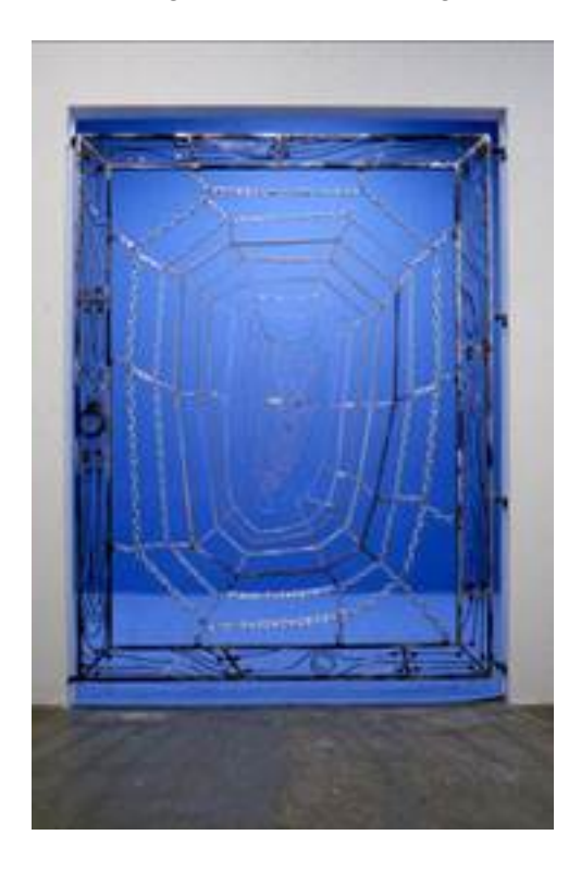
Untitled (Gate) by Jim Hodges, 1991