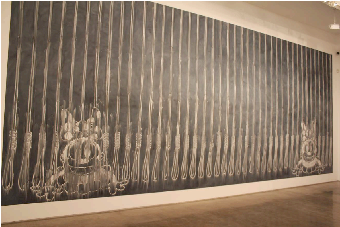
Installation view of "Here's...Honey," 1992.