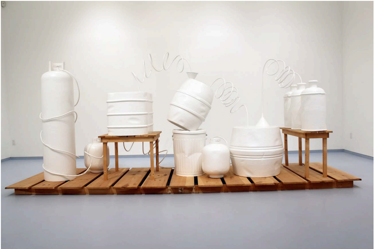
"Big Still," 2001.