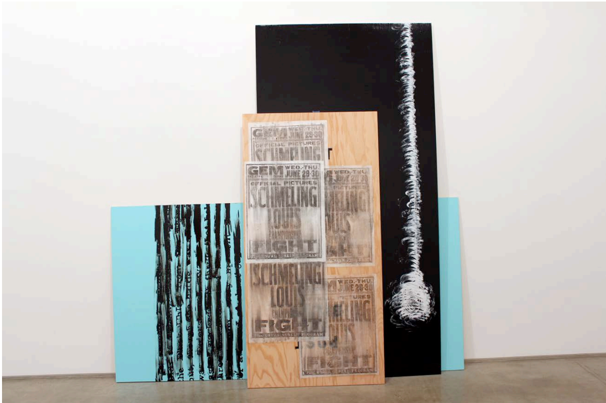
"Ticket Review Fall," 2012.