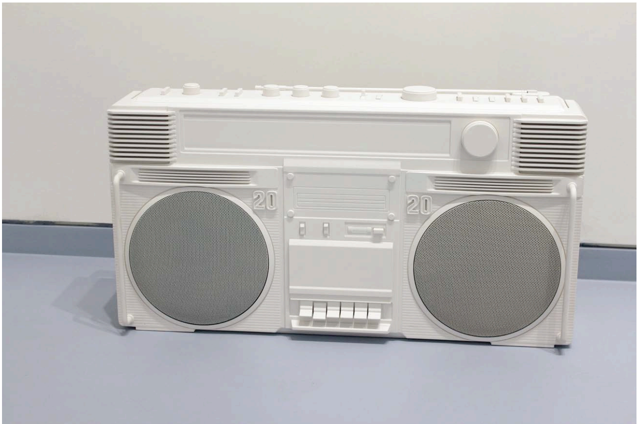
"Shine," 2004 (fiberglass).