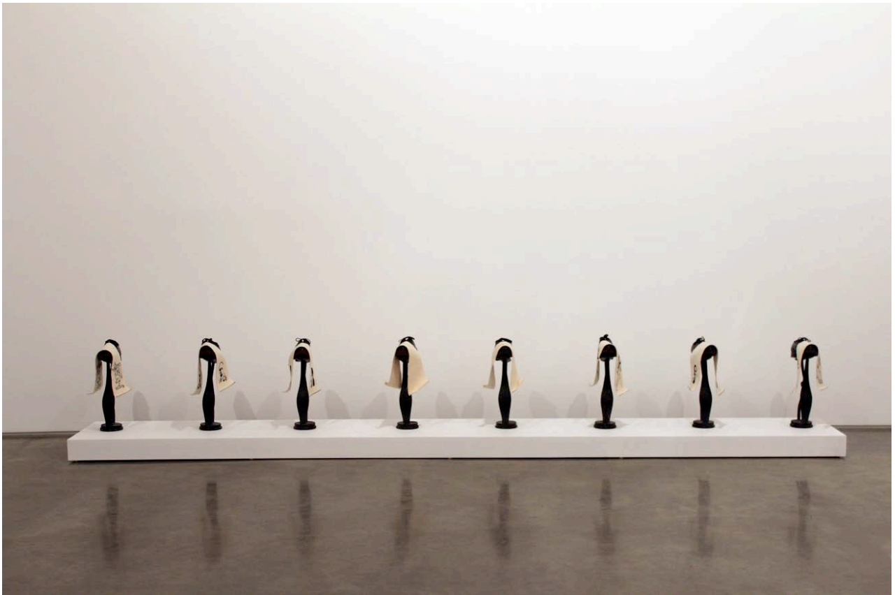
Installation view of "Fuck Hollywood."