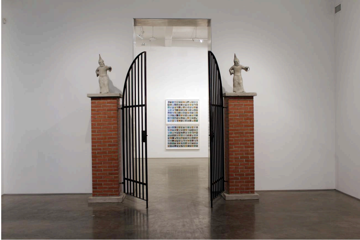
Installation view of "Klan Gate," 1992.