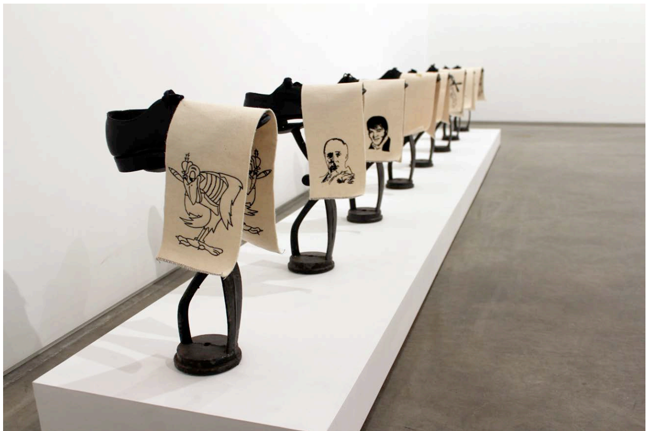
Detail of "Fuck Hollywood," 1991.