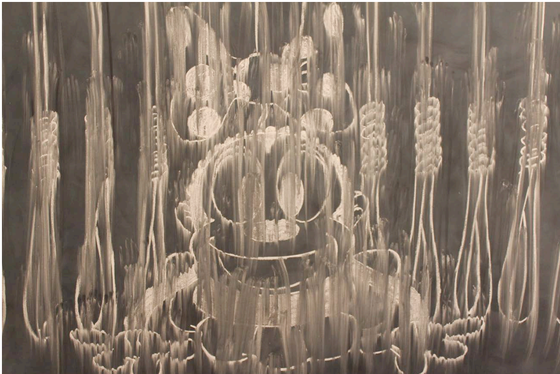
Detail of "Here's...Honey."