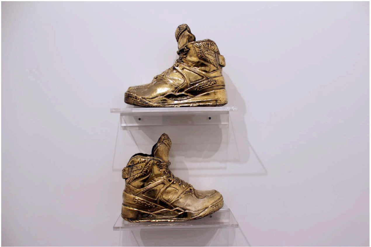
"Pump it Up, 1991.