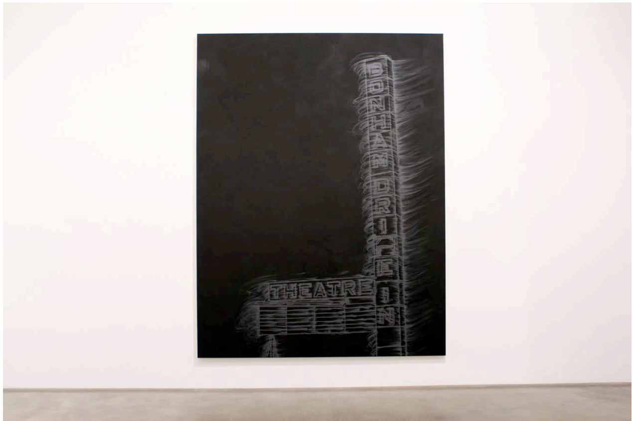
"Bonham Theatre," 2010.