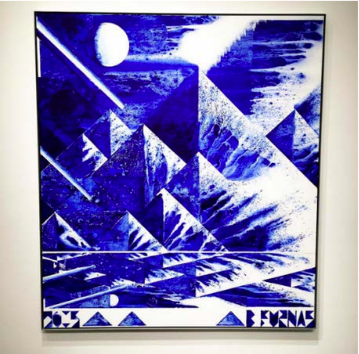
Barnaby Furnas, The First Morning (Blue Mountains) (2015), via Art Observed

Accordingly, Furnas's work here turns his influences not into historical touchstones, but as pure aesthetic containers, removing their modes of practice in "en plein air" landscapes and the subsequent relationship to reality, and keeping the technical or formal gestures of these artist's hands, or their particular temperaments for color and shade. Yet at the same time, the works here remain distinctly tied to Furnas's own unique practice. The triangular forms of prior works and series return here as measured and cut canvas, affixed to his compositions as a method of distancing his canvas from a cohesive plane, yet never depart from tightly controlled combinations of color and gesture. While the work's cut and paste nature is clearly seen, the fragmented elements feel cohesively joined together.