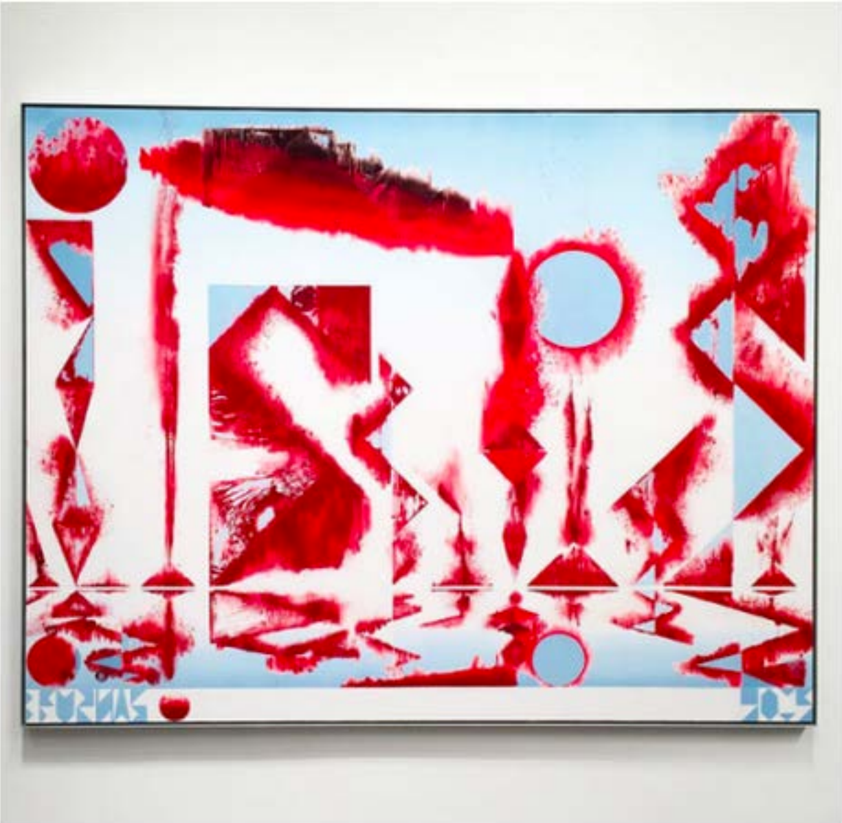
Barnaby Furnas, The First Morning (Scarlet) (2015), via Art Observed