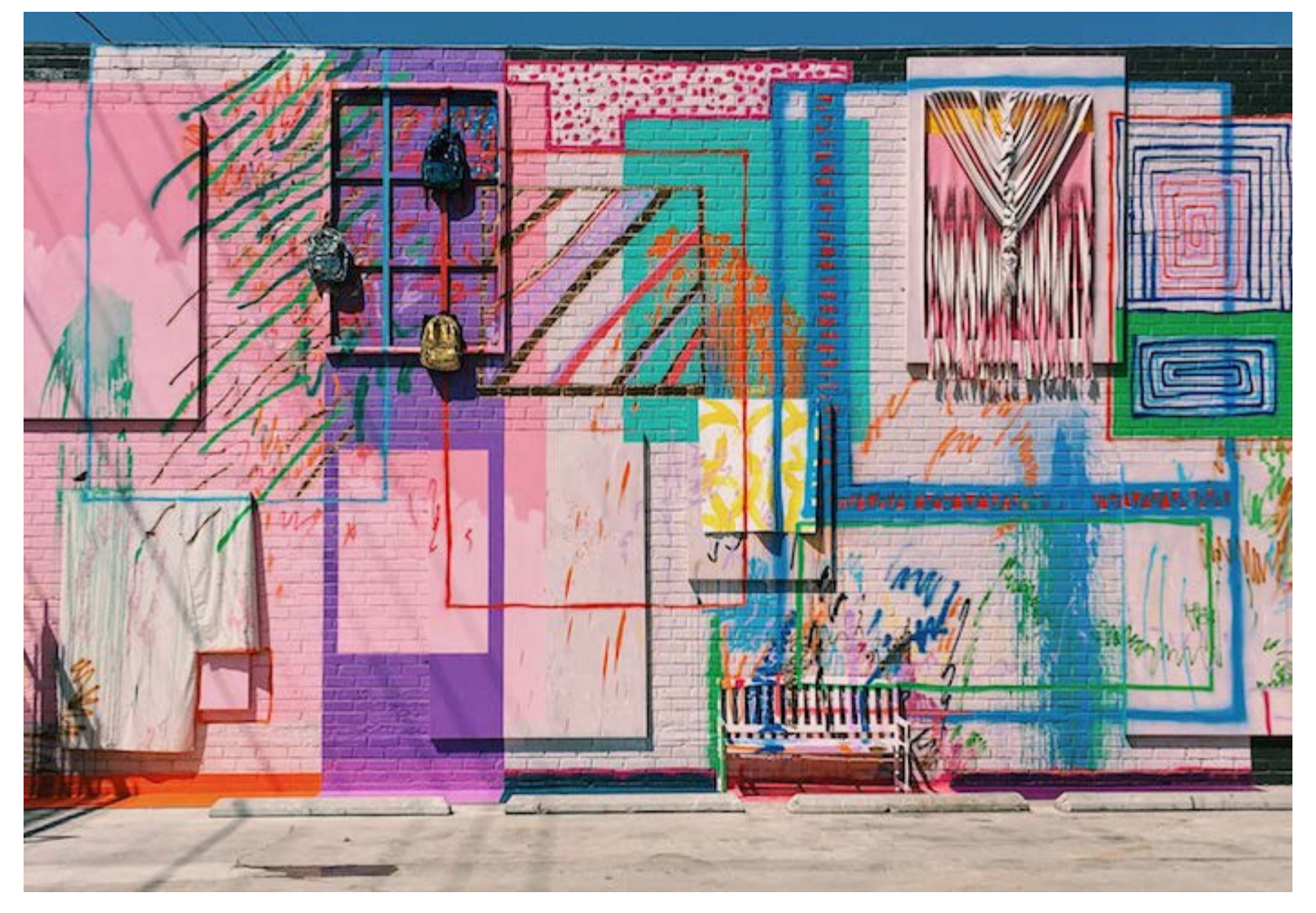
New kid on the block, Institute of Contemporary Art, Los Angeles in DTLA.