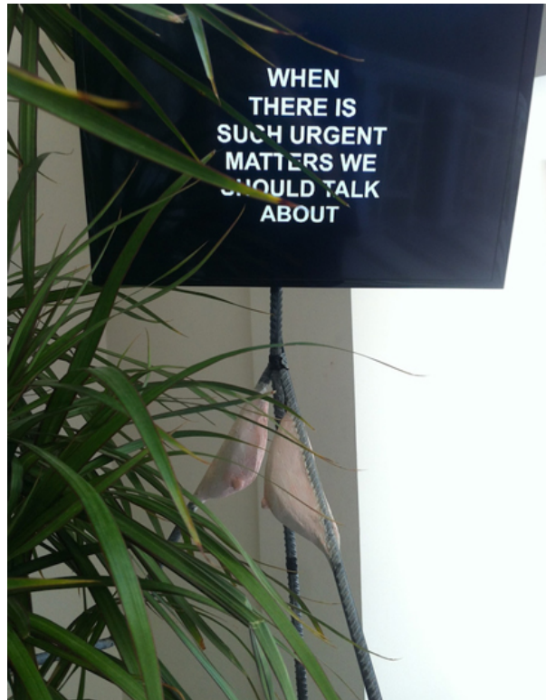
Laure Prouvost, Metal Woman bringing a salty plant upstairs (detail), 2017, video, metal sculpture, plaster boobs and bums, and tree. ©LAURE PROUVOST/COURTESY LISSON GALLERY