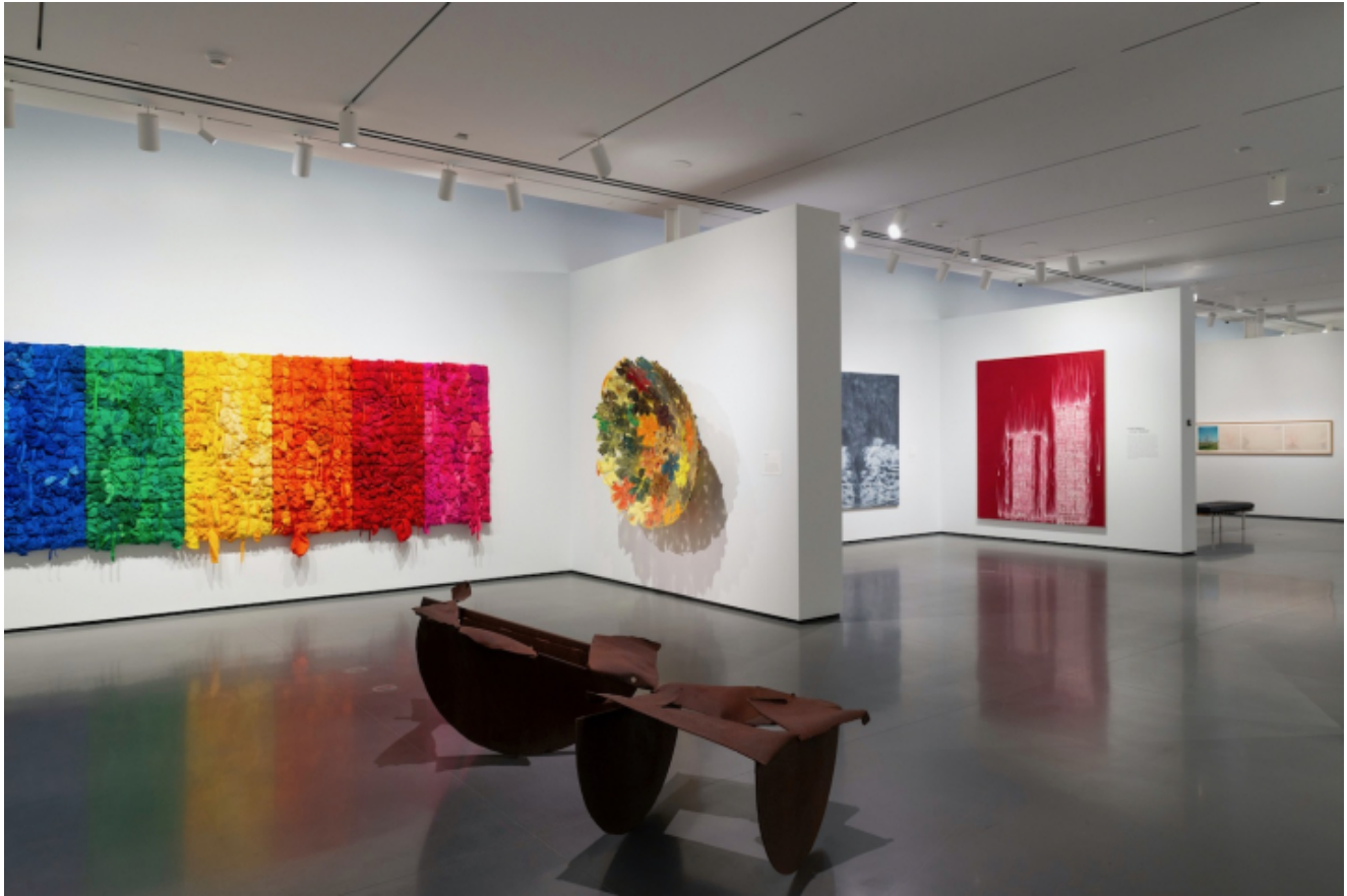
Installation view of the first gallery in Generations: A History of Black Abstract Art

The layout brilliantly matches architectural space to organizing themes; abstraction stretches the viewer not only through space and across materials, but through time as well. The conversations set up between the pairings of artists within each niche are equally fascinating. For example, Shinique Smith's textile bundles chats amiably with Kevin Beasley's resined rainbow of split ball caps, both buoyantly exuberant in color. Glenn Ligon's and Jennie C. Jones's works, on the other hand, convey a mutual sense of restraint that operates like a coiled spring. Ligon's "One Black Day" (2012) and Jones's series "Composition for Sharps" (all 2010) are joined in the ways they subtly use black materials to differentiate blackness from Blackness. Other personal favorites here include Alma Thomas, Leonardo Drew, and Frank Bowling — all represented well in the exhibition. A bonus was discovering images by Gary Simmons, of serenely apocalyptic burning buildings, which I hadn't seen before. An extra treat was reading Melvin Edwards's anecdote about Norman Lewis once telling him to shut up, and then getting to see the works that this contretemps inspired.