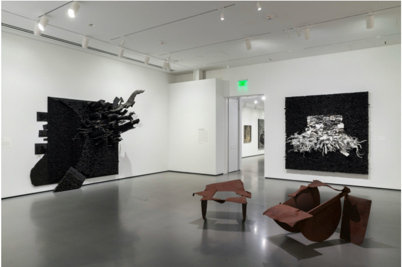
Installation view of the first gallery in Generations: A History of Black Abstract Art including (in the foreground) Melvin Edwards's "A Conversation with Norman Lewis" (1979) (courtesy BMA,)

Still, the show left me with some questions. I don't understand why there were cobwebs on Glenn Ligon's "One Black Day" (2012) when I saw it. Nor why Lynette Yiadom-Boakye, whose work here is mainly portraiture, was included in the show. Also, the show's closing is much too male-centric with one of the last galleries filled with nine or ten works by men and only three by women — Howardena Pindell, Barbara Chase-Riboud, and Virginia Jaramillo — who are crucial to this historical retelling.