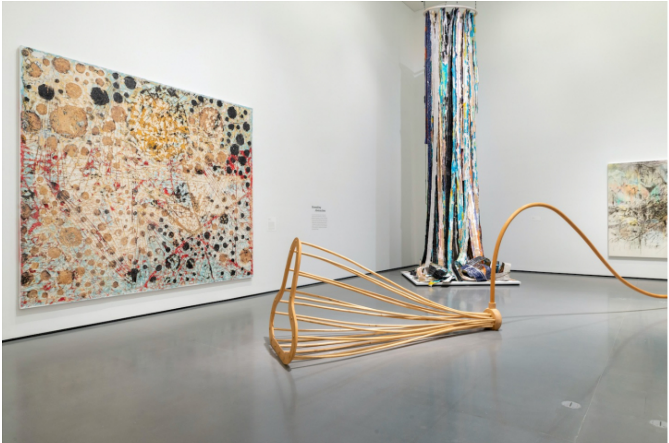
Installation view of the first gallery in Generations: A History of Black Abstract Art

BALTIMORE — Walking through the first gallery of Generations: A History of Black Abstract Art at the Baltimore Museum of Art feels a bit like being on a slow rollercoaster ride. On the wall opposite the entrance is Mark Bradford's "My Grandmother Felt the Color" (2016), a painting of splotchy and mostly subdued hues whose surface has been scored by some sharp utensil so much so it feels like it wasn't so much painted as wrenched into being. To the right of it I face Bradford's second piece in the room, "A Private Stranger Thinking About His Needs" (2016) — a cascade of colored ribbons of canvas, twine, and paper from billboards and flyers pulls my gaze all the way to the top of the 28-foot gallery ceiling. Swiveling right again, I encounter Jack Whitten's "9-11-01" (2006), a work in which catastrophe is made enthralling. I could happily spend hours analyzing it. Then, I take stock of the work in the very middle of the gallery, Martin Puryear's "Lever #2" (1988-1989) a wooden armature which looks like the found and restored skeleton of a creature from the Cretaceous period.