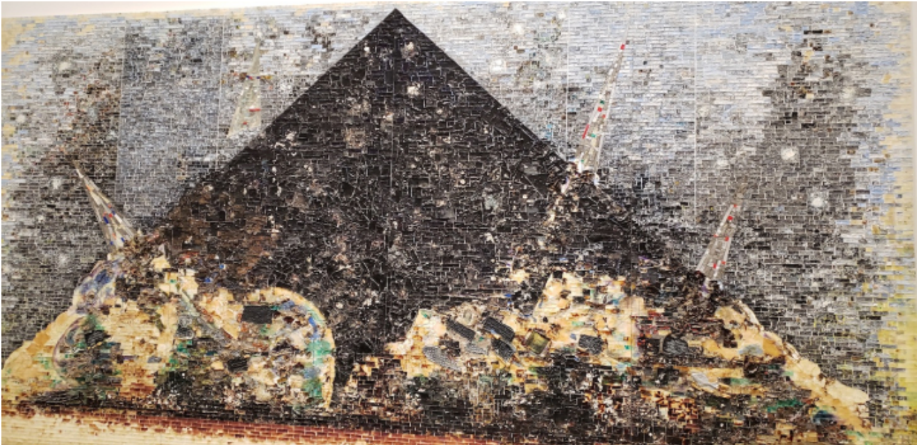
Jack Whitten, "9-11-01" (2006) acrylic and mixed media on canvas, 120 × 240 inches

This layout sweeps me horizontally around the room, and up, up, up to Bradford's tattersall deluge to splash down into Puryear's ancient bones. And there's more. I turn to face the enfilade that leads into the rest of the show and I'm presented with a long passageway with grottos off to the side, out of which peek images of the work of great Black artists I recognize at a glimpse: Glenn Ligon, Alma Thomas, Norman Lewis, and further on, Leonardo Drew, Sam Gilliam, and Shinique Smith. Generations offers an art historical canon to explore, but inside the niches I feel as if I'm at a cookout where most of the people are (extended) family. Most shows can't or don't hold these very separate aspects in synchronous rotation: sober assessment of an art-historical lineage and a feeling of intimacy. This one does.