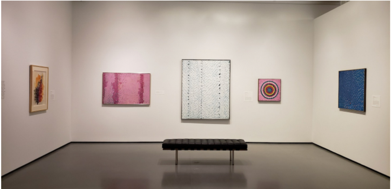
Installation view of the gallery of Alma Thomas' work in Generations: A History of Black Abstract Art