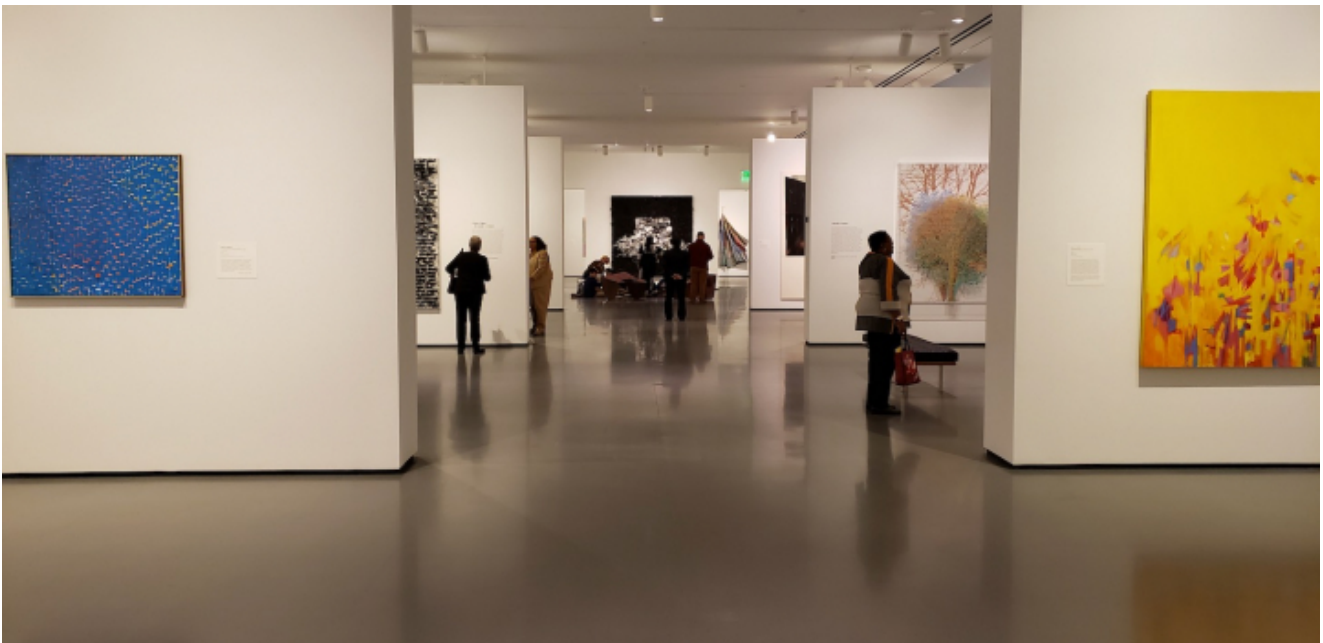
View into the galleries downstream from the first gallery of Generations: A History of Black Abstract Art

This layout sweeps me horizontally around the room, and up, up, up to Bradford's tattersall deluge to splash down into Puryear's ancient bones. And there's more. I turn to face the enfilade that leads into the rest of the show and I'm presented with a long passageway with grottos off to the side, out of which peek images of the work of great Black artists I recognize at a glimpse: Glenn Ligon, Alma Thomas, Norman Lewis, and further on, Leonardo Drew, Sam Gilliam, and Shinique Smith. Generations offers an art historical canon to explore, but inside the niches I feel as if I'm at a cookout where most of the people are (extended) family. Most shows can't or don't hold these very separate aspects in synchronous rotation: sober assessment of an art-historical lineage and a feeling of intimacy. This one does.