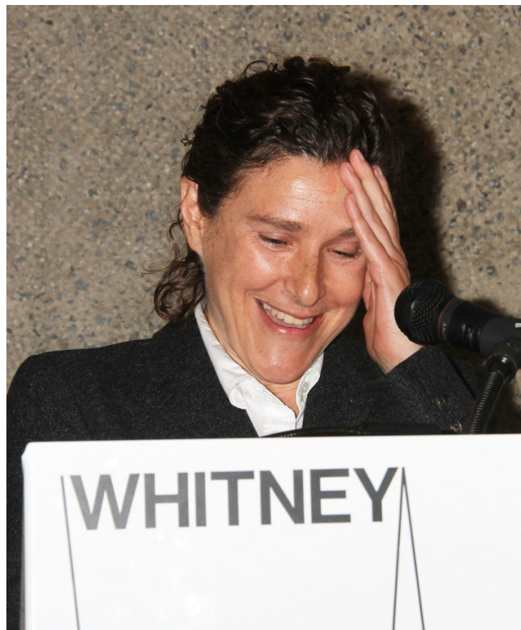
Zoe Leonard.