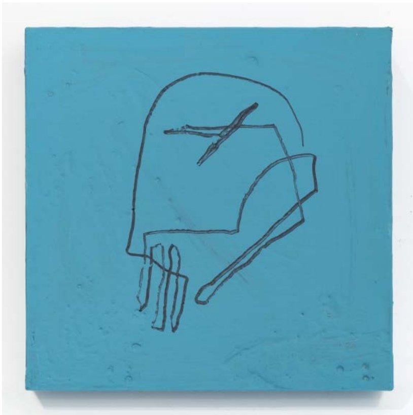
Drone Control, 2016. Acrylic and ink on panel, 8 x 8 inches.