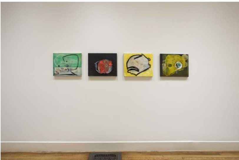
Installation view, OSVRX, JJ PEET at Anthony Meier Fine Arts, San Francisco, 2017.