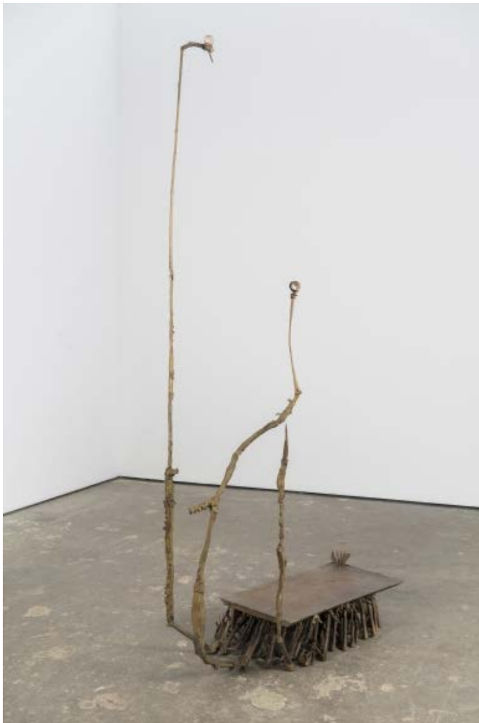
Transfer Station, 2017. Bronze and porcelain, 73 x 24 x 13 inches.