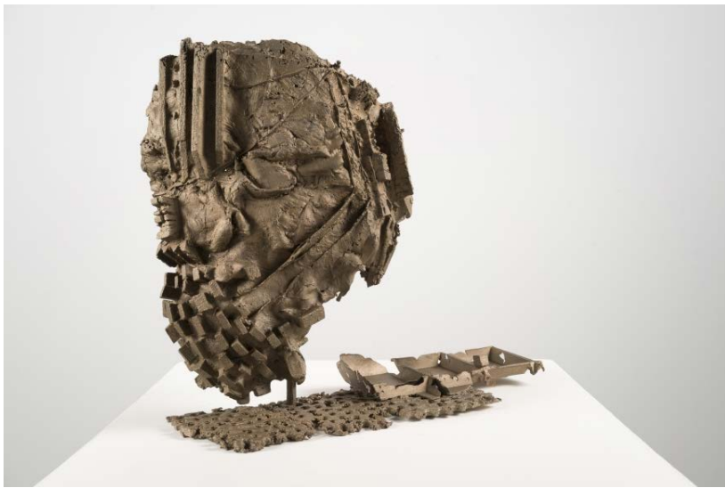
REFLECTION, 2017. Bronze, 18 x 12 x 7 1/2 inches. Courtesy of Anthony Meier Fine Arts.